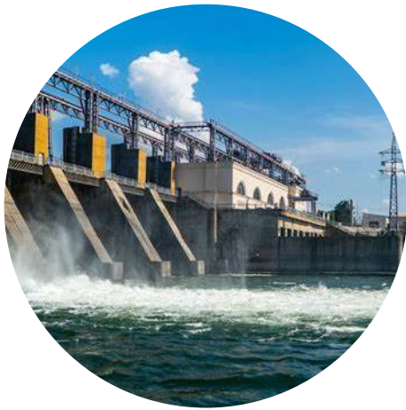
Hydro Power Plant