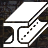
Steel and related products