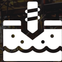
Managed Pressure Drilling