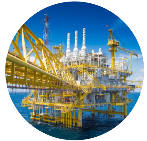
Oil and Gas Facility