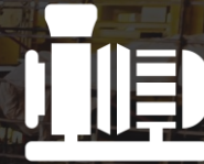
Ultra-High-Speed Electric Submersible Pump