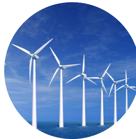
Wind Power Plant