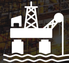
Offshore Drilling Service