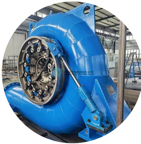
Turbine and Generator